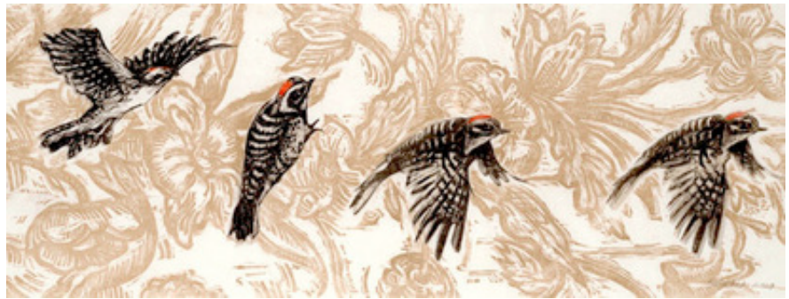
Image above : Sylvia Walters, Oakland, CA Untitled (Woodpeckers) , Woodcut, 12" x 20" From think show