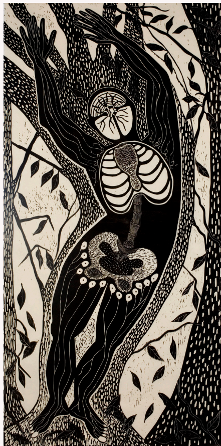
Debra Olin, Rooting , woodcut, 72" x 36"

Museum of Fine Arts Boston, Harvard Art Museums, deCordova Museum, Worcester Art Museum and the Boston Public Library, this panel discussion will provide insight into the wealth of prints and print collections in and around Boston.