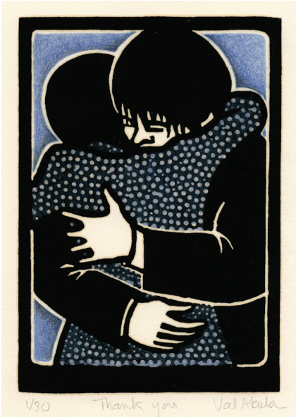
Val Akula, Thank you , linocut, 6 x 4 1/2" (Contemporary Print)