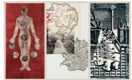
Exhibition card (Scollay Square)

Scollay Square Gallery, Boston City Hall, Main Lobby 1 City Hall Square, Boston, MA 8:30am - 5:30pm Mon - Fri www.boston.gov/departments/arts-and-culture/city-hall-galleries