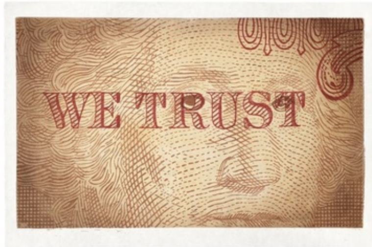
Image above : Annie Bissett, WE TRUST Japanese Woodblock Print 25" x 38.5"