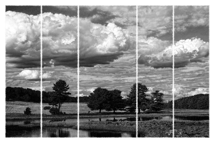
Martha Jane Bradford, Sheepscot Village Trees, digital drawing

Imprinted Traces , invitational of eight women printmakers, Bath House Cultural Center, Dallas TX, September 2008.