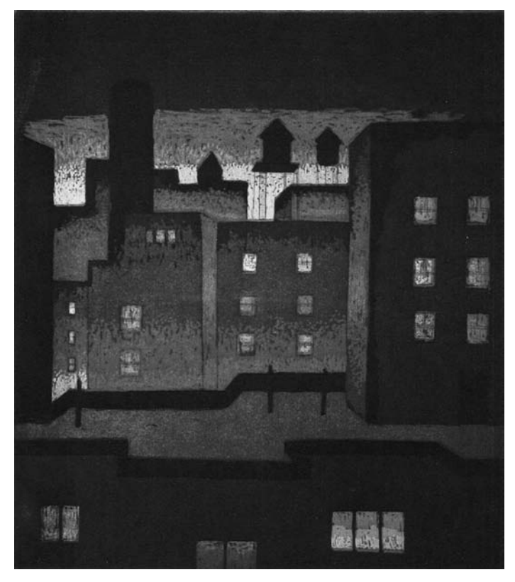
Phyllis Sloane, Night in the City, etching

Prints USA , 2007, featured a linocut at Springfield Art Museum, Springfield MO