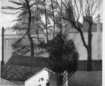
Linda Adato, Between Seasons, color etching, aquatint and soft ground