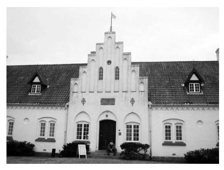
Ronnebaeksholm Arts & Culture Centre

The exhibition included over 1,500 prints by 765 artists from 52 countries and was the first great manifestation of international mini prints in Denmark. Prints were then donated to the Study Archives of the workshop. All participating artists received a printed catalogue and web-catalogue with pictures of all the prints and info about the artists are at: www.grafisk-kunst.dk.