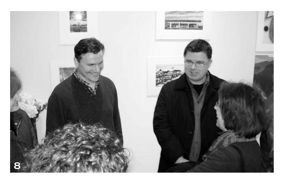
THE BOSTON PRINTMAKERS FALL 2008