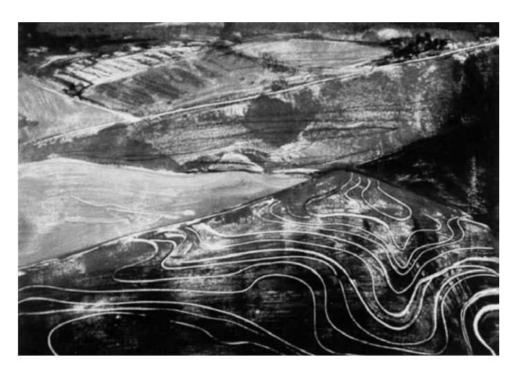
Joan Appel, -scape, monoprint

5th International Book & Paper Arts Triennial included the artist's book "The Transforming Power of Time" at Columbia College Center for Book & Paper Arts, Chicago, IL. July 25 - September 13, 2008.