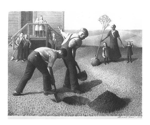
Tree Planting Group, 1937 Grant Wood, Lithograph ACM 80.293

Art Complex Museum, 189 Alden Street, Duxbury MA 02331 781-934-6634 www.artcomplex.org