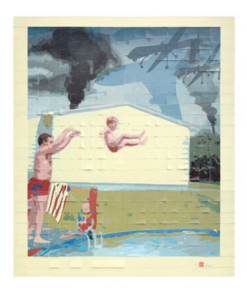
Droneland Afternoon, 2014 Dirk Hagner, San Juan Capistrano, CA 12 color relief reduction print and stencil on 552 canary yellow post-its, 3 x 3" each, 72 x 52 ½"

The Art Complex Museum has a rich and comprehensive print collection. It encompasses seventeenth century Dutch etchings and engravings as well as modern Japanese, American and European nineteenth and twentieth century etchings, engravings, woodcuts, wood engravings, lithographs, and drypoint prints. It also includes a large number of contemporary prints in a variety of techniques, including work purchased by The Boston Printmakers for the museum collection from the North American Print Biennial - one of the most prestigious events in printmaking.