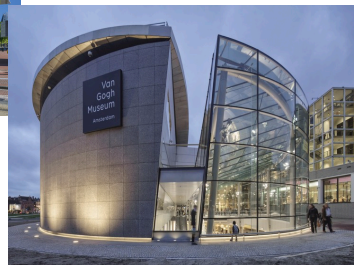
Van Gogh Museum