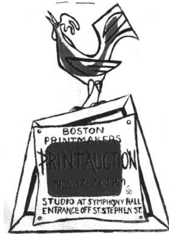
Symphony Hall Print Auction Notice, 1950