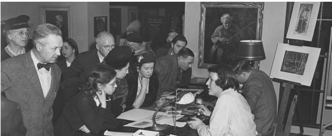
Crowd at Paine Furniture Company for the First Annual Boston Printmakers Exhibition, 1948

It has become a Boston area tradition to celebrate The Boston Printmakers with print exhibitions, special events, and receptions as this venerable institution marches through the decades. This year Boston City Hall, the Boston Public Library, Lesley University, the Boston-Cambridge art communities, and the executive board of The Boston Printmakers have collaborated to create The Boston Printmakers: 70 Years , a day long symposium on prints and printmaking to be held Saturday, March 3, 2018 from 10am-6pm at multiple venues.